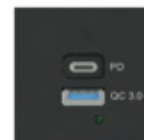
30W dual port USB-A & USB-C with PD, QC3.0