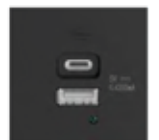
21W dual port USB-A & USB-C