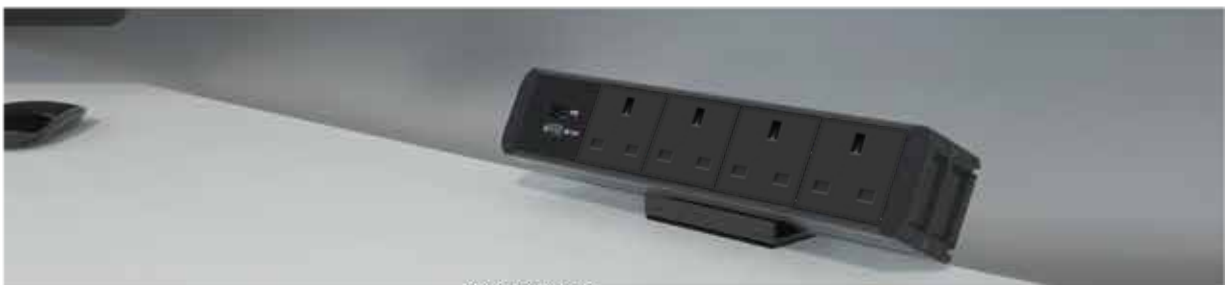
Shared work desk