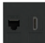
RJ45 CAT6 HDMI