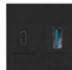
Keystone USB-C & USB-A3.0 data*